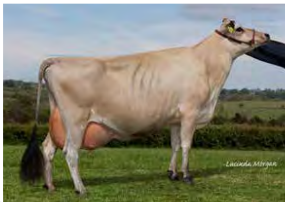
RAPIDBAY-UK WON BELLE EX94-6E dam of Lot 186