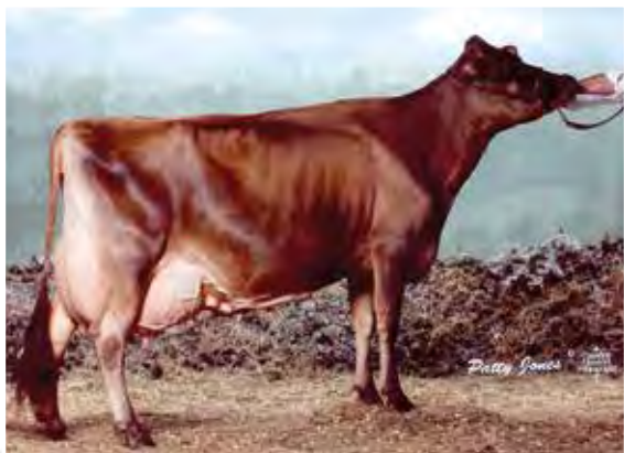
DUNCAN BELLE EX92-2E 27* Gdam of Lot 188