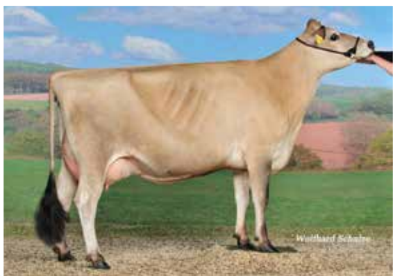
RAPIDBAY-UK GAUPO BELLE VG86 (2YR) Maternal Sister to Lot 188