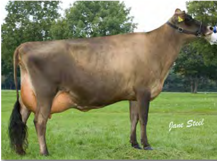
POTTERSWALLS VINDICATION NIKKI EX94-5E GM(2) MM(4)

Potterswalls Junos Nikki Ex92-2E 7745kg 5.19% 3.90%