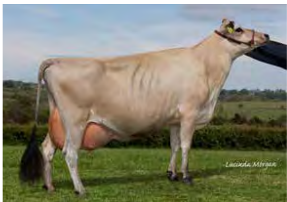
RAPIDBAY-UK WON BELLE EX94-6E dam of Lot 188